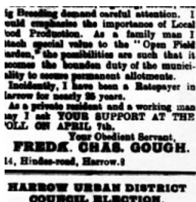
Figure 4: Election address (detail), Harrow Observer 4 April 1919, p. 4.