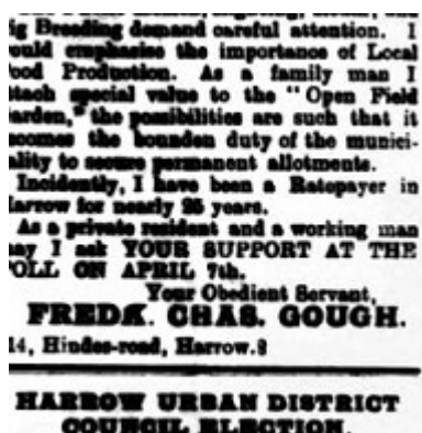
Figure 4: Election address (detail), Harrow Observer 4 April 1919, p. 4.